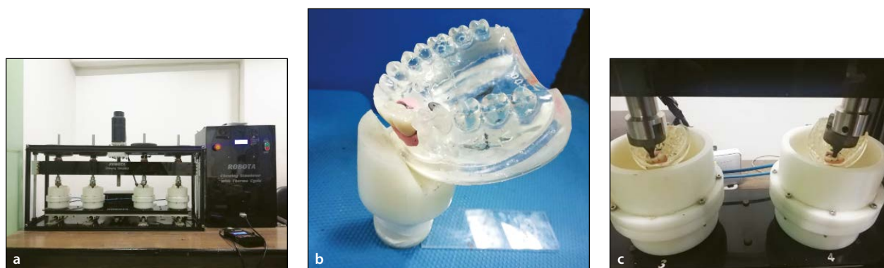
Fig 2 (a) Four-station load cycling machine with specimens in position; (b) the specimen positioned and secured with custom-made positioning device; and (c) specimens mounted inside the chamber during load application.

ultrasonically for 10 minutes and air-dried. The inner surfaces of the zirconia restorations and the bonding area of the prosthesis caps were primed (MKZ Primer, Bredent Medical). The resin cement (DTK Adhesive, Bredent Medical) was mixed and applied into the fitting surface of the zirconia restoration and the bonding area of the prosthesis cap, following the manufacturer's recommendations. Each restoration was adhesively bonded to its respective prosthesis caps using resin cement (DTK Adhesive, Bredent Medical), following the manufacturer's instructions. All restorations were kept in distilled water for 3 days to ensure proper setting of the resin cement.