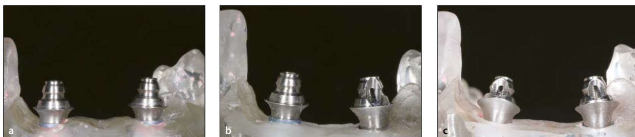
Fig 1 The screw-retained multiunit abutments attached with their corresponding implants: (a) both are straight abutments; (b) one is straight, and one is an angulated abutment; and (c) both are angulated abutments.

problem of screw loosening has been reported to be influenced by the type of implant-abutment interface, screw material, friction coefficient, restoration design, occlusal table, and implant diameter and number. 20–23 The loosening of the abutment or prosthesis screws can induce problems, such as disturbance in transfer and distribution of applied occlusal forces, fracturing of the screw or implant, and microgap formation at the implant-abutment interface, which allows bacterial leakage with subsequent effects on the osseointegration. 24,25 A number of causes can be related to screw loosening, such as improper implant positioning, inadequate tightening of the screw, excessive mechanical loading, and temperature variations in the oral environment. 26–28