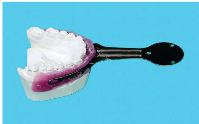
Figure 1. Device's clutch, prepared with light polymerized acrylic resin.

Ninety-eight young adults, (26.0 ±5.2 years) without previous orthodontic treatment participated in this study. No participant had any history of the signs and