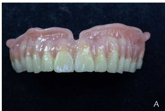
Figure 3. A, Prepared space for GSCR on denture surface. B, Light-polymerizing resin primer.