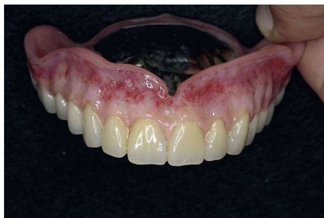
Figure 7. Polished customized denture.