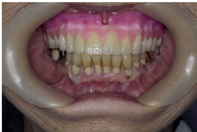
Figure 1. Colored trial wax denture made with colored waxes.