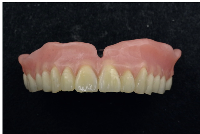
Figure 2. Acrylic resin denture after heat-polymerization.