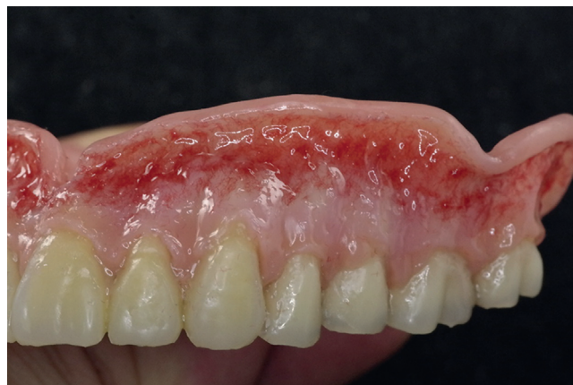
Figure 6. Gingival veins produced by gingival stain and short fibers.