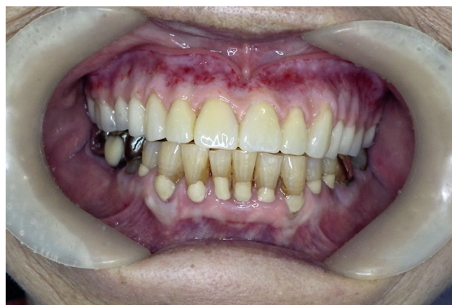
Figure 8. Patient with customized denture.