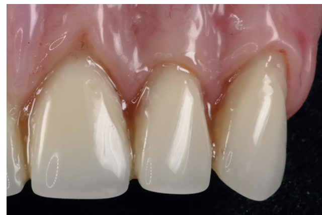
Figure 9. Mimicking saliva at gingival sulcus area with light-polymerizing clear resin.