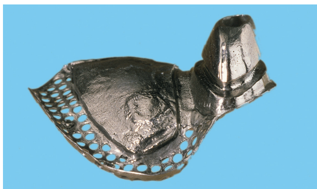
Figure 3. Polished titanium framework. Note circular retention groove resulting from use of half round wax profile.