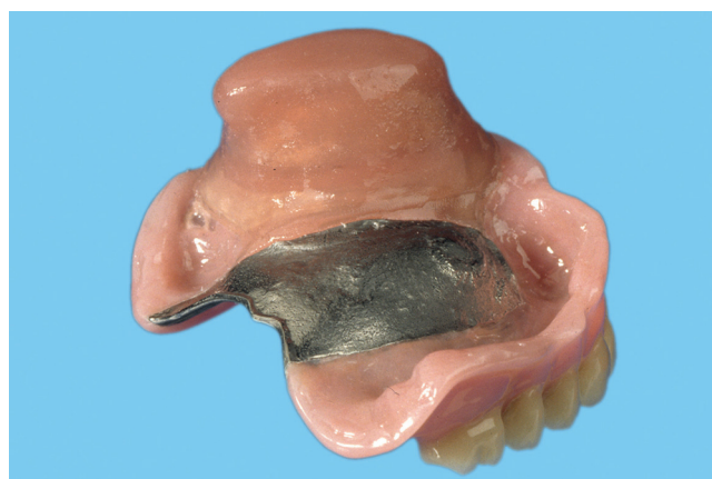
Figure 5. Obturator prosthesis with flexible cap attached. Interface between hard denture base resin and soft cap is clearly visible.

In contrast with solid or hollow obturators made exclusively of denture base resin, 5,9,10 the use of titanium facilitates the fabrication of stable and biocompatible obturator prostheses. The biggest advantage is weight reduction because of the low density of titanium. A further advantage is the option of quality control by inspecting the titanium cast for voids using an x-ray device. Soft tissue changes in the resected area as cicatrices, tissue shrinkages, and neoformations can be easily compensated with corrections on the replaceable cap