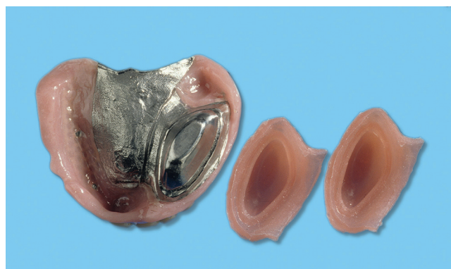
Figure 4. Obturator prosthesis with 2 flexible caps from intaglio. Hollow obturator completed with cast titanium lid.