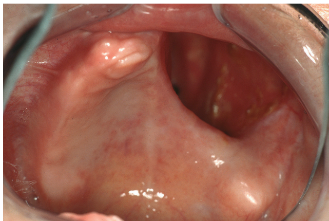
Figure 1. Maxillary defect after extensive tumor surgery.