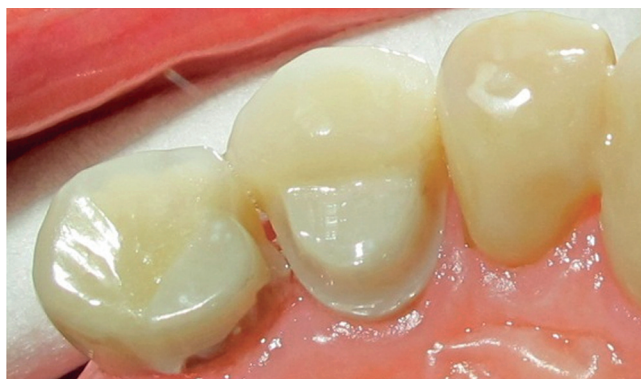
Figure 3. Fracture of zirconia occlusal rest seat in maxillary premolar RDP abutment tooth.

Zirconia has changed traditional treatment concepts in single crowns and RDPs. The improved esthetics support the use of zirconia, despite the metal RDP framework. The material properties of ceramics make the design of the occlusal rest seat more rounded than in metal ones, which may reduce resistance form. However, in this study, the retention and stability were recorded as good in most of the RDPs with a metal framework.