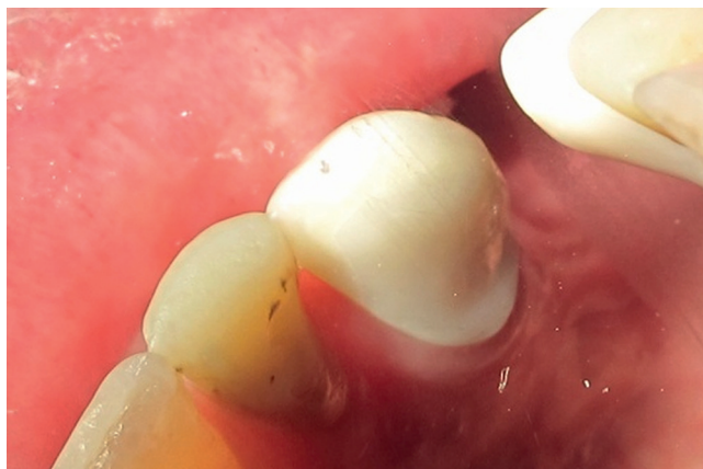
Figure 2. Design of occlusal rest seat in zirconia single crowns as abutment tooth for RDP is more round than in metal ones.